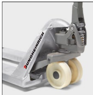
Permanently lubricated joints for maintenance-free operation