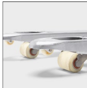
Contoured fork tips for easy pallet entry