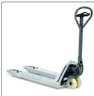
AM G20 - corrosion protection through galvanisation