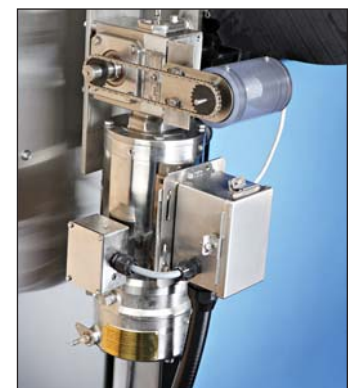
Optional stainless drive system