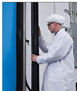
Easy to remove side frame